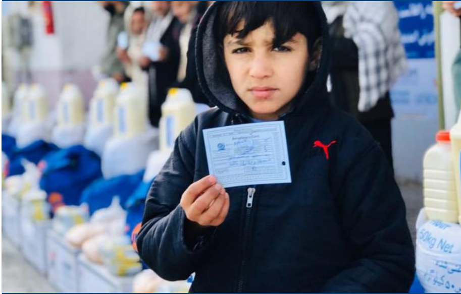
A returnee child receiving assistance in the Kandahar Transit Center