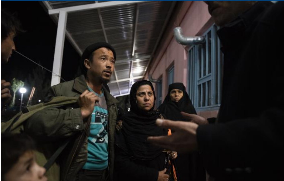
A returnee family arrives at the Herat Transit Center at night after being deported from Iran. During their journey they were kidnapped by smugglers and held for ransom.