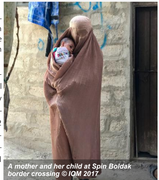
A mother and her child at Spin Boldak border crossing

Of the total returnees, 1,402 were spontaneous returnees and 62 were deported. This number is a 26% decrease compared to the previous week. The total number of undocumented Afghan returnees from Pakistan since 01 January 2017 is now 81,286. IOM provided post-arrival assistance to 94% of undocumented Afghan returnees from Pakistan (1,378 individuals), including 1,182 individuals in poor families, 170 individuals in single parent families and 23 special cases. The assistance provided includes meals, accommodation, basic medical screening, Non-Food Items (NFIs), onward transportation cash grants and referral services, as well as support from partners (see Annex 1).