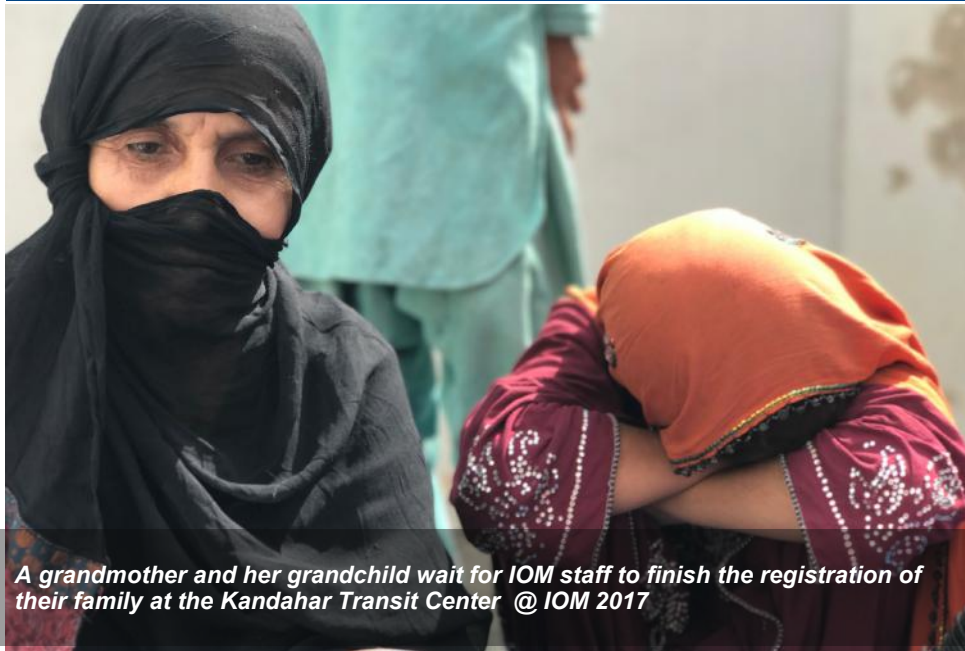
A grandmother and her grandchild wait for IOM staff to finish the registration of their family at the Kandahar Transit Center