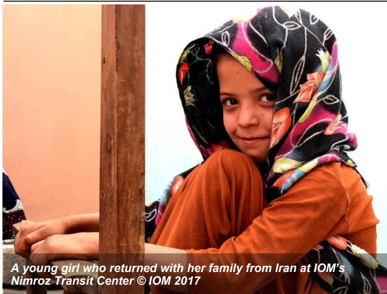
A young girl who returned with her family from Iran at IOM's Nimroz Transit Center