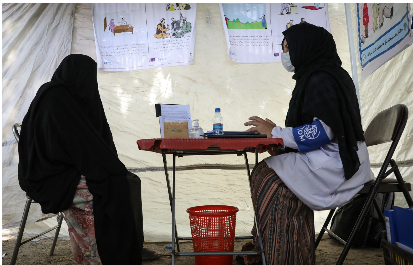
A member of the IOM's health team provides psychosocial consultation to a woman in a remote area in Nangarhar.