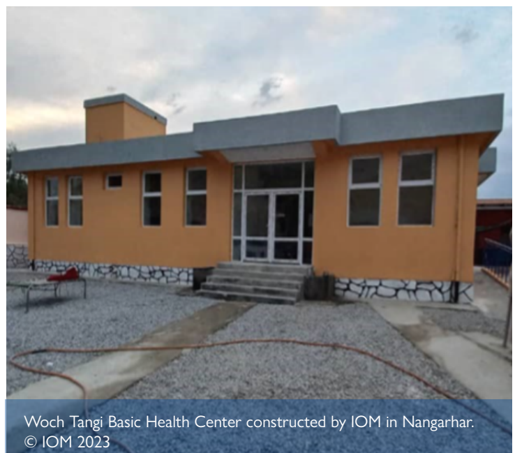
Woch Tangi Basic Health Center constructed by IOM in Nangarhar.

Lastly, IOM supported the Deh-e-Araban School in Kabul by providing the water supply system, including a borehole and solar panel systems. The school was also provided with new blocks of latrines and a set of benches and desks.