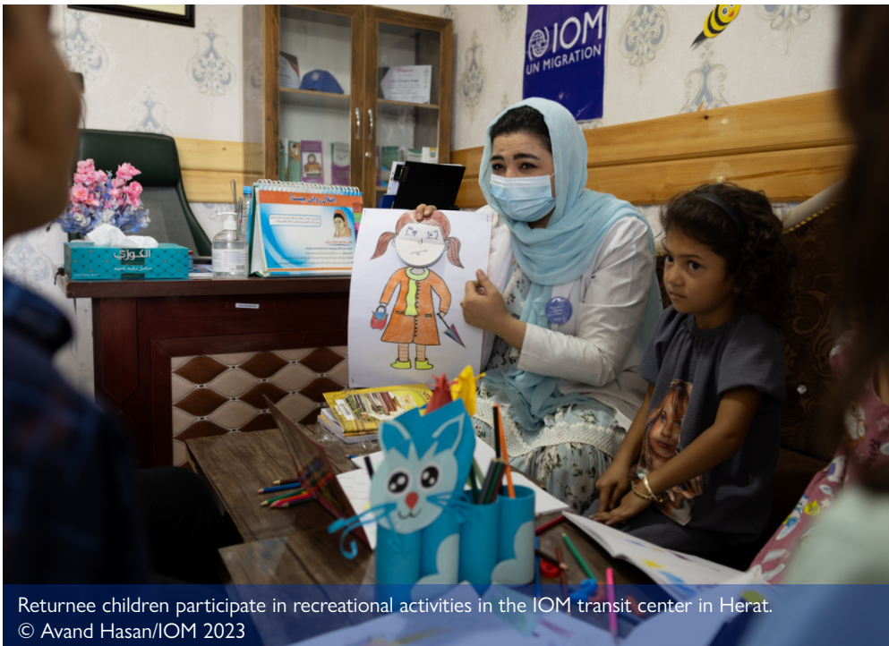
Returnee children participate in recreational activities in the IOM transit center in Herat.