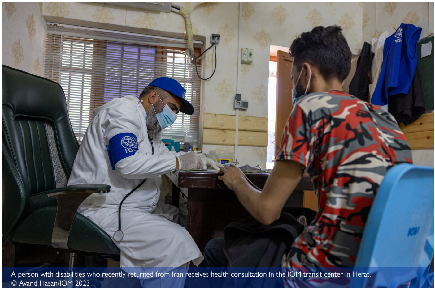
A person with disabilities who recently returned from Iran receives health consultation in the IOM transit center in Herat.

1,160 undocumented returnees received protection case management