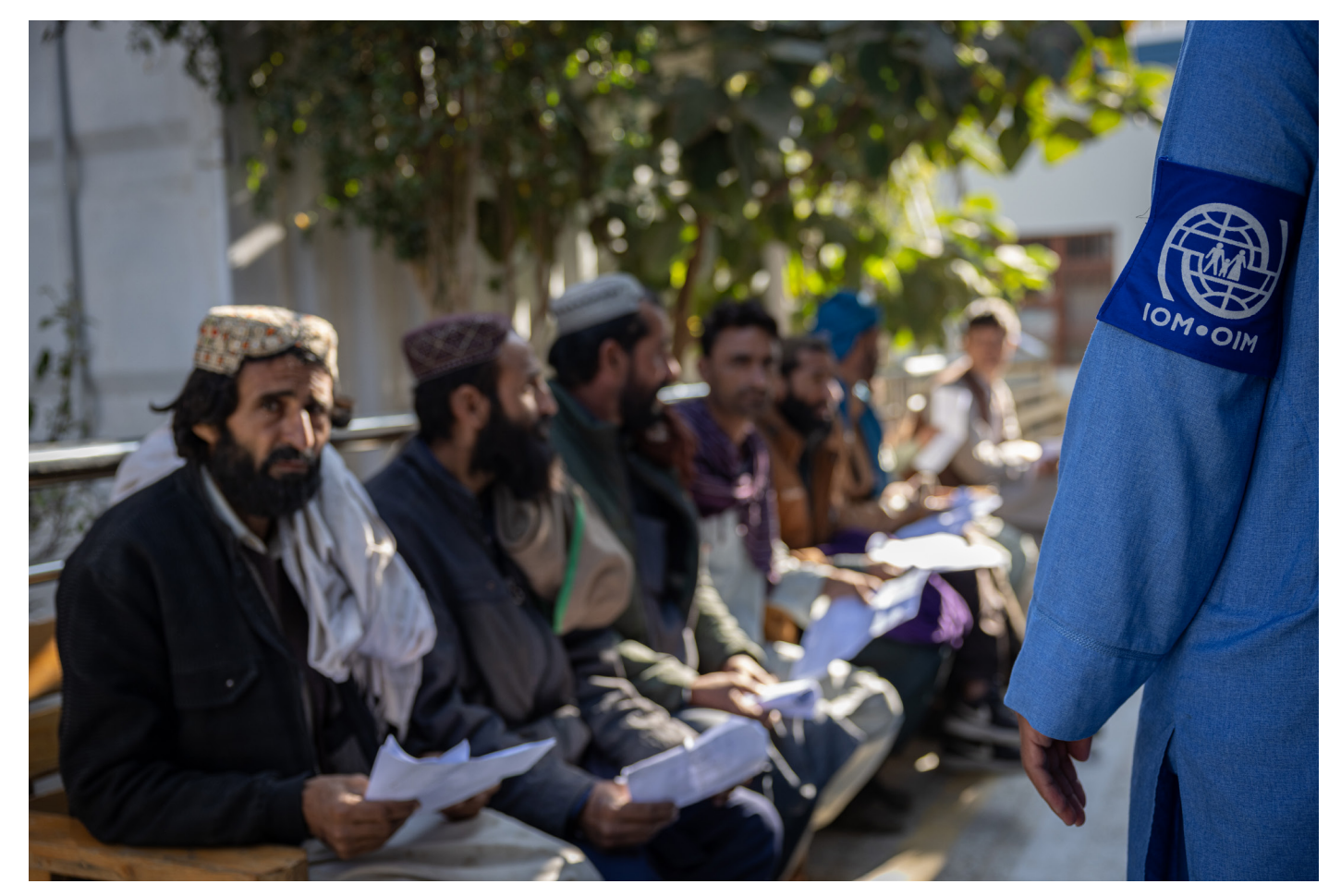
Afghan returnees from Pakistan wait to register at the IOM Transit Center in Kandahar.

Since 2020, disaster incidence has steadily risen as one of the main forces driving displacement in Afghanistan. Reflecting these trends, Afghanistan is projected to be one of the countries most impacted by environmental and climate change in the coming years and is ranked 175 out of 181 countries according to relative vulnerability and ability to cope with climate change. IOM Afghanistan is working to address these needs, promoting interventions that will increase the knowledge-base surrounding the migration, environment, and climate change (MECC) nexus in Afghanistan and enable programming that will buttress community resilience to climate and environmental hazards. Through these efforts, IOM Afghanistan is aligned with IOM's Institutional Strategy on Migration, Environment and Climate Change 2021-2030, striving to provide a) solutions for people to move, managing migration in the context of climate change, environmental degradation, and disasters due to natural hazards, b) solutions for people on the move, assisting and protecting migrants and displaced persons in the context of climate change, environmental degradation, and disasters due to natural hazards; and c) solutions for people to stay, making migration a choice by building resilience and addressing the adverse climatic and environmental drivers that compel people to relocate.