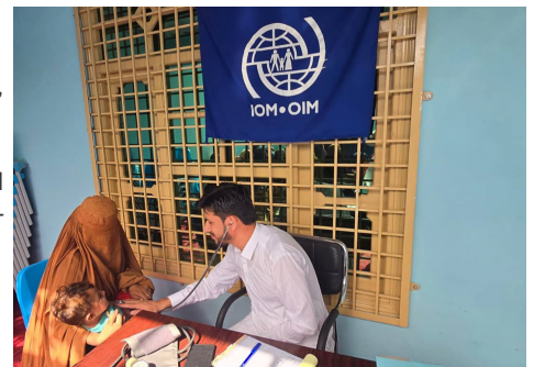
IOM's Health team provides health services as part of a health camp at the CRC.