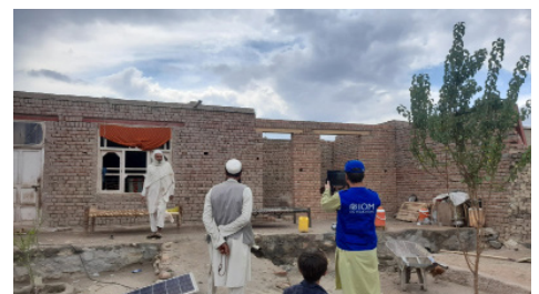
IOM Shelter and WASH teams conduct joint assessments for assistance in Chamtalla.