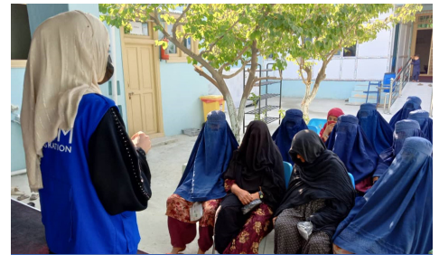
An IOM CCCM community mobilizer delivers an awareness raising session for women on Awaaz, PSEA and available services.

Vulnerable individuals and households are identified to receive assistance that links humanitarian emergency support to durable solutions opportunities. These include livelihoods assistance, such as apprenticeships, job placement and business start-up/expansion support; rehabilitation and construction of transitional shelters and latrines for households; winterization assistance; MHPSS services and assistance for acute and chronic health conditions of community members, including referrals to secondary and tertiary healthcare; and food assistance. Beneficiaries are identified and selected through referrals from CRCs as well as through sectoral assessments with harmonized vulnerability criteria. As part of this humanitarian-development-peace nexus approach, IOM supports a continuum of care for returnees from providing humanitarian assistance at the border to supporting their reintegration in areas of return, and actively monitors their progress towards achieving durable solutions.