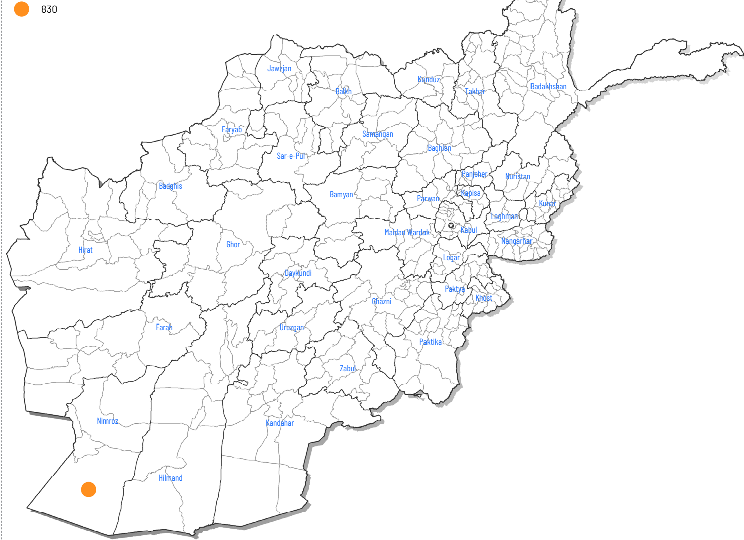
Number of Affected People by District (All Disasters)

* Shelter includes houses, accommodation, and temporary shelter